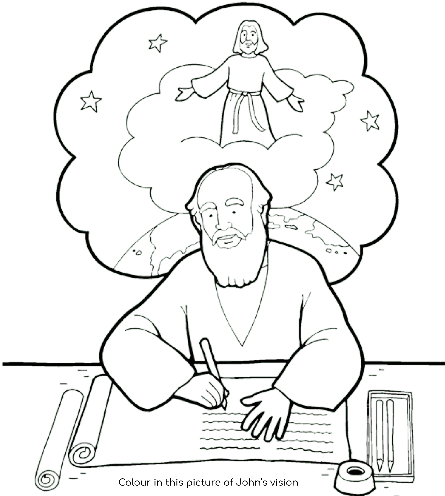
Colour in this picture of John's vision

Main point: God is with us in all times and has power over all things